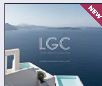
LUXURY GREECE COLLECTION